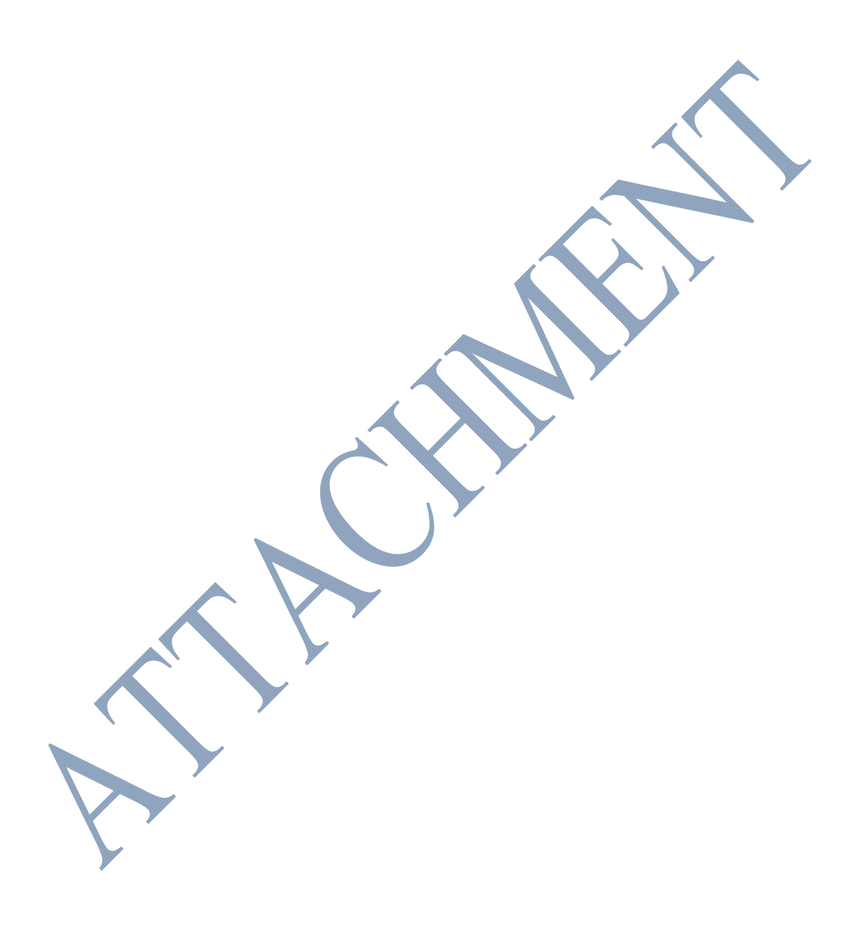
March 9, 2011 - Regular Meeting Minutes