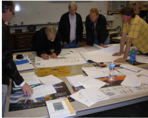
Madrone Building Design Development/Cost Estimating Meeting at Columbia College