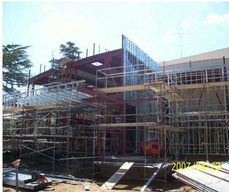
Auditorium construction at Modesto Junior College East Campus