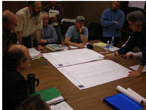
Science & Natural Resources Building Schematic Design Meeting at Columbia College