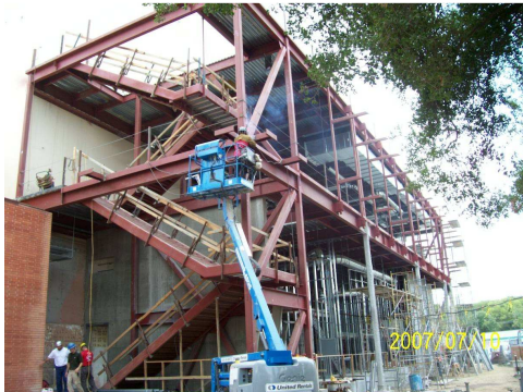
Auditorium construction at Modesto Junior College East Campus