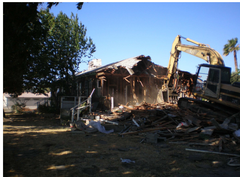
MJC Ag Student Housing Demolition

Columbia College $ 0.00 Modesto Junior College $ 0.00 Central Services $ 0.00 Total Changes to Date $ 0.00