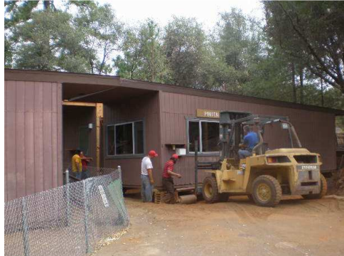
Pinyon Relocation Project construction at Columbia College