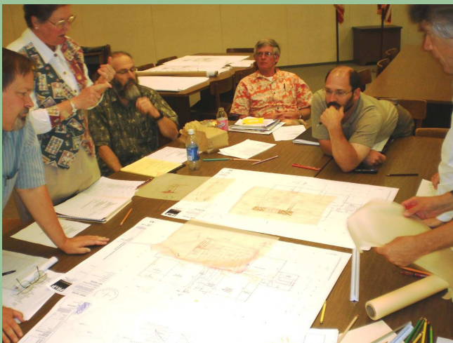
Design Meeting on May 21, 2007