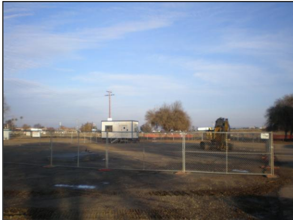
Temporary Fence at Lay Down Area