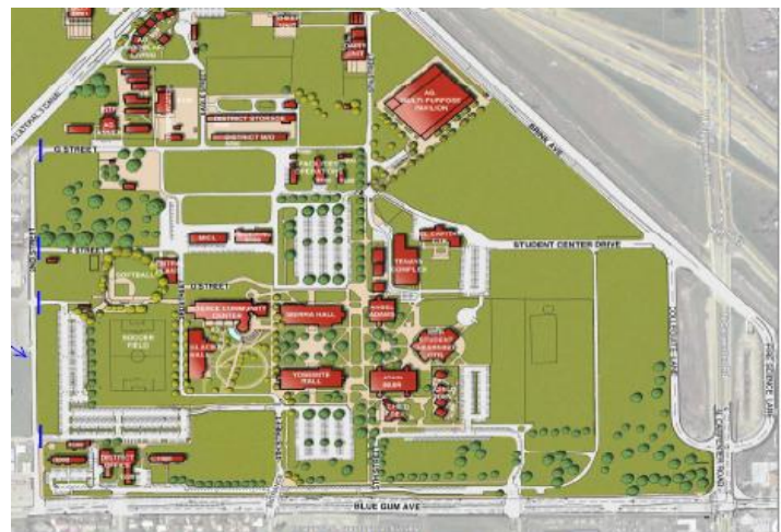
— LOCATIONS OF THE NEW GATES AT 2 nd STREET

If there are any questions or concerns contact Kitchell CEM, Measure E Bond Construction Manager, located at 2201 Blue Gum Ave., Modesto CA 95358 Tel: 575-6991 Email mkennedy@kitchell.com