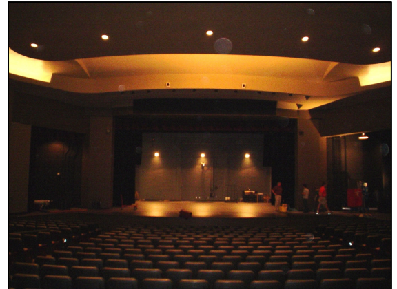
The Main Stage