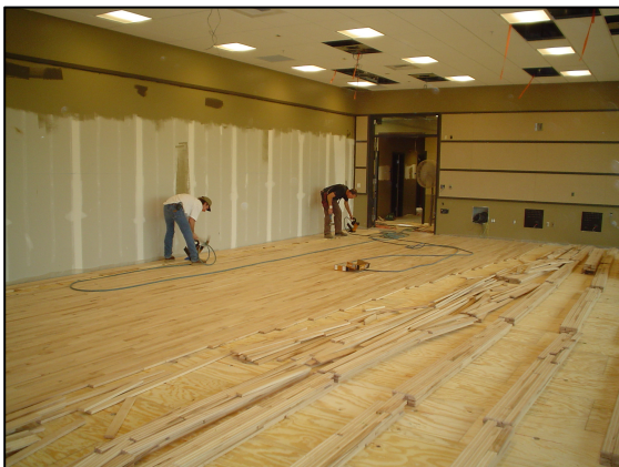
Installing Hardwood Floor in the Multipurpose Room