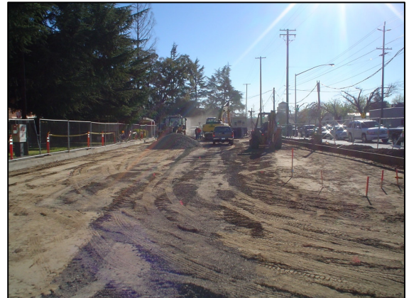
Grading the West Side of the South Parking Lot