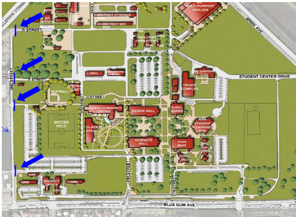
— LOCATIONS OF THE NEW GATES AT 2nd STREET

If there are any questions or concerns contact Kitchell CEM, Measure E Bond Construction Manager, located at 2201 Blue Gum Ave., Modesto CA 95358 Tel: 575-6991 Email mkennedy@kitchell.com