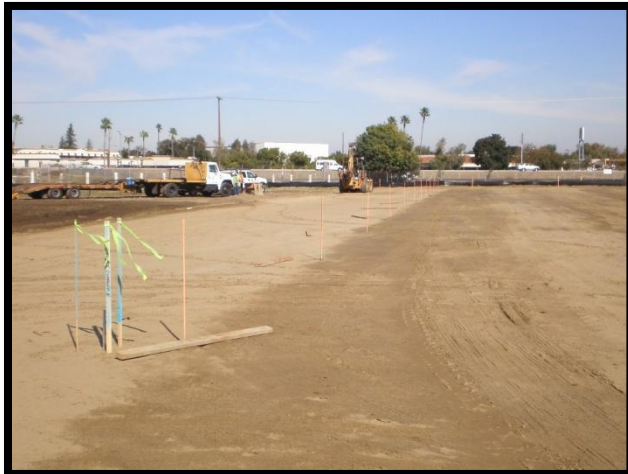
Survey Grid Lines