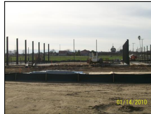
Agriculture Beef Unit

Columbia College $ 0.00 Modesto Junior College $ 0.00 Central Services $ 0.00