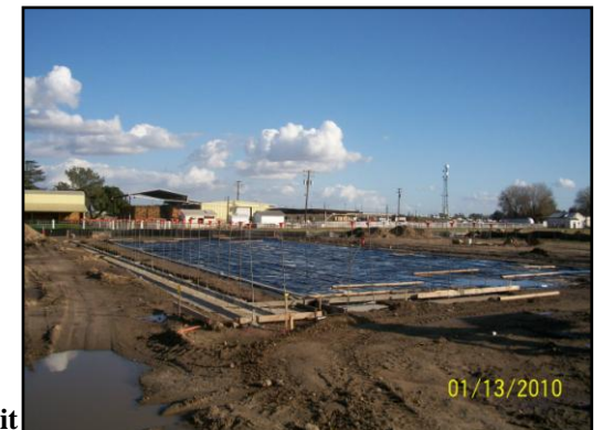
Agriculture Sheep Unit