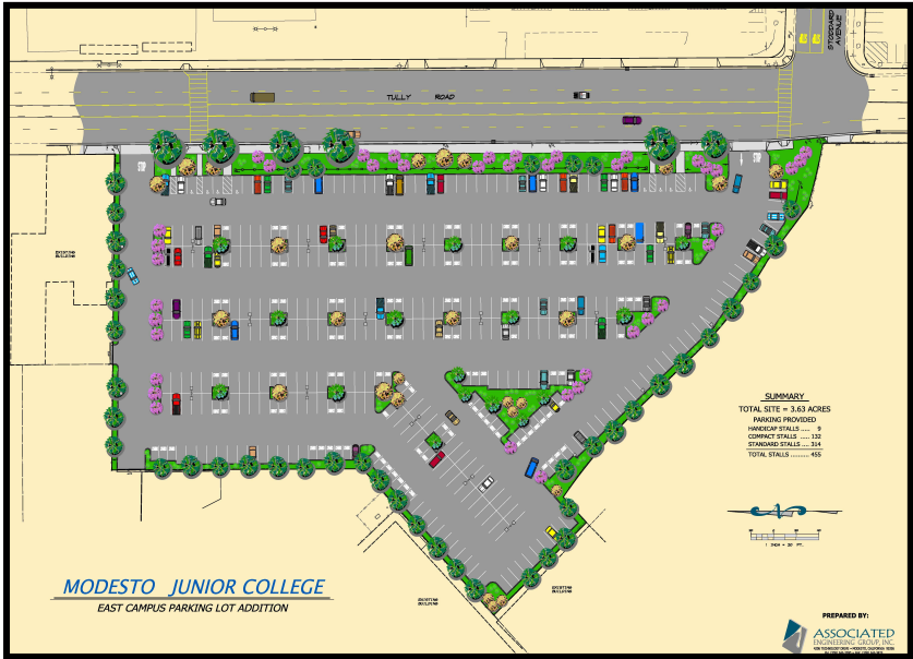
MJC Parking Lot Project