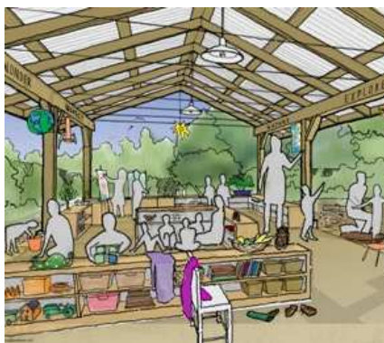
Columbia College Child Development Center Project Outdoor Learning Center

ANOVA, Lionakis, LPA Sacramento, Perkins + Will, tBP Architecture, TLCD/WMB