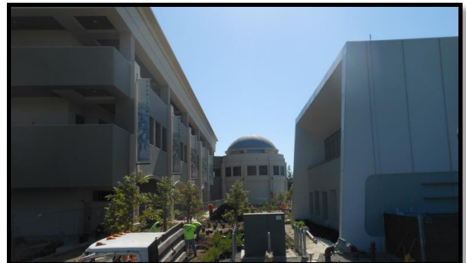
Infrastructure Phase II Increment II