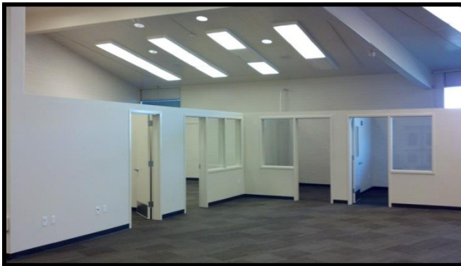
MJC Career Transfer Center