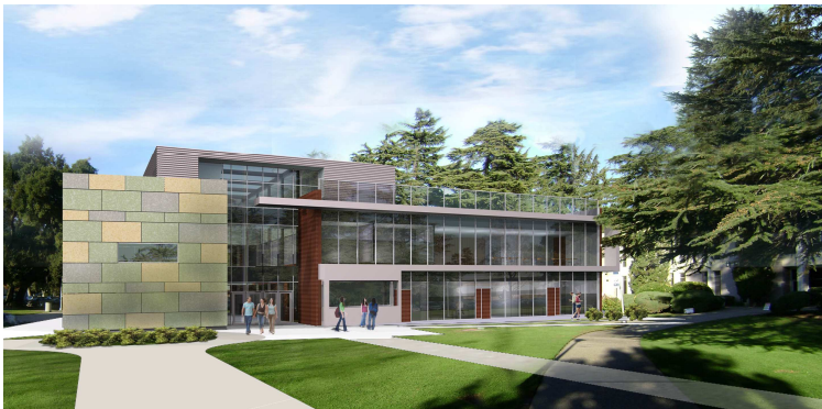
MJC East Campus New Student Services Building Rendering