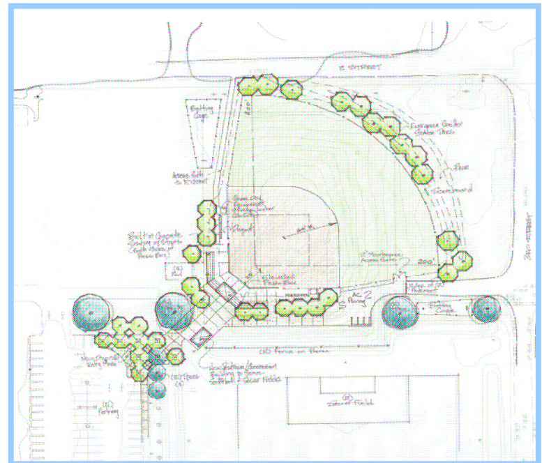
MJC West Campus Softball Complex Master Plan Concept

Columbia College $ 0.00 Modesto Junior College $ 0.00 Central Services $ 0.00 Total Changes to Date $ 0.00