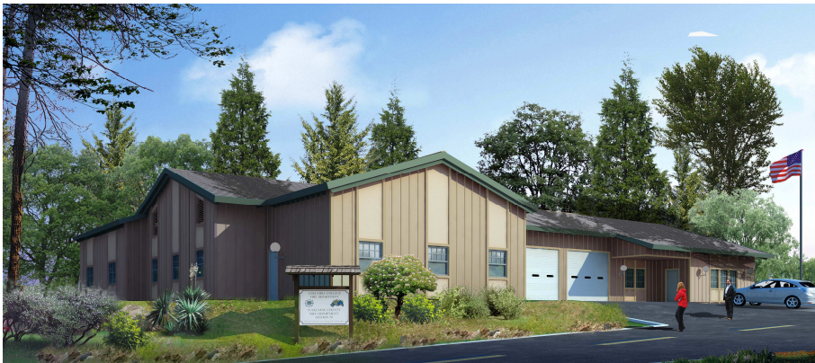
Columbia College Public Safety Center Rendering

Columbia College: Buckeye Sewer Pump Replacement project is complete.