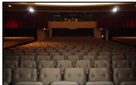
Main Theatre Seating