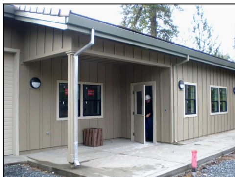
Columbia College Public Safety Center

ANOVA, Lionakis, LPA Sacramento, Perkins + Will, tBP Architecture, TLCD/WMB