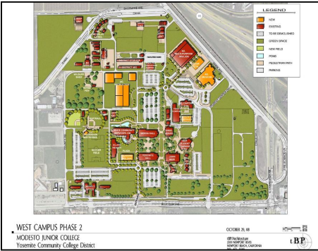
MJC East and West Campus Phase II Master Plans