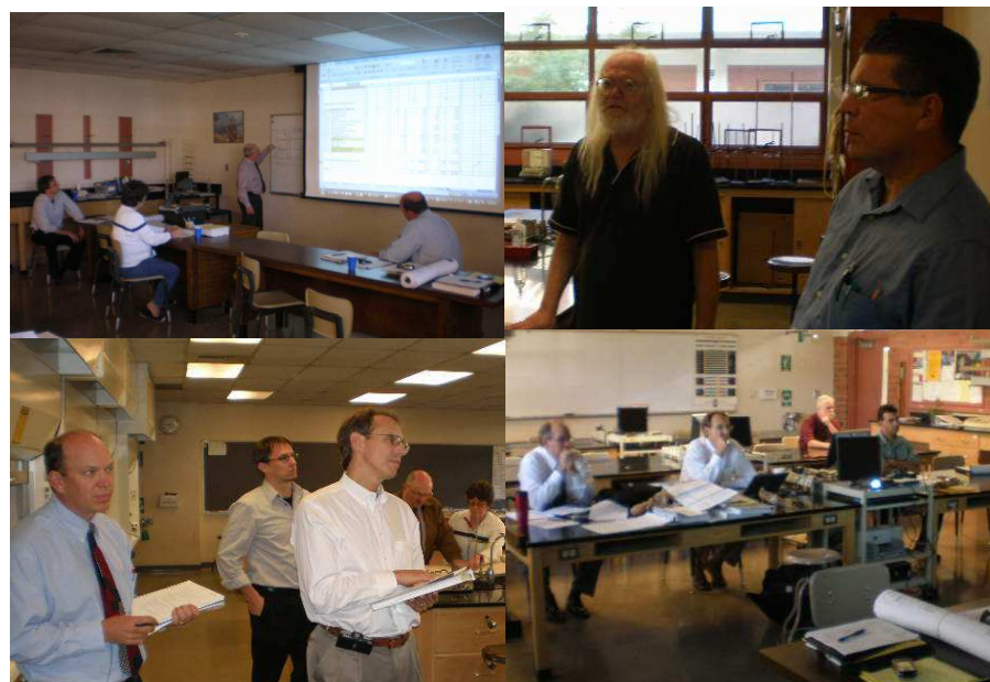
MJC Science Community Center & Great Valley Museum Programming Meeting