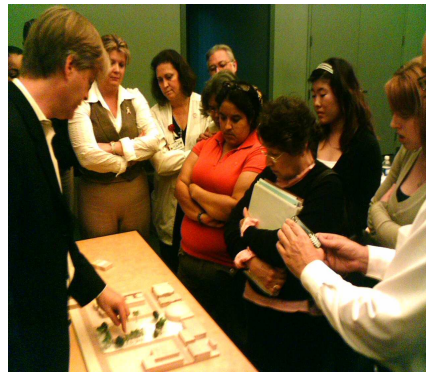
MJC students provide input on the Student Services Project

Campus Planner – BFGC Architects – LBDG, LPA Sacramento, Murray & Downs, Perkins + Will, Studios, tBP Architecture, TLCD