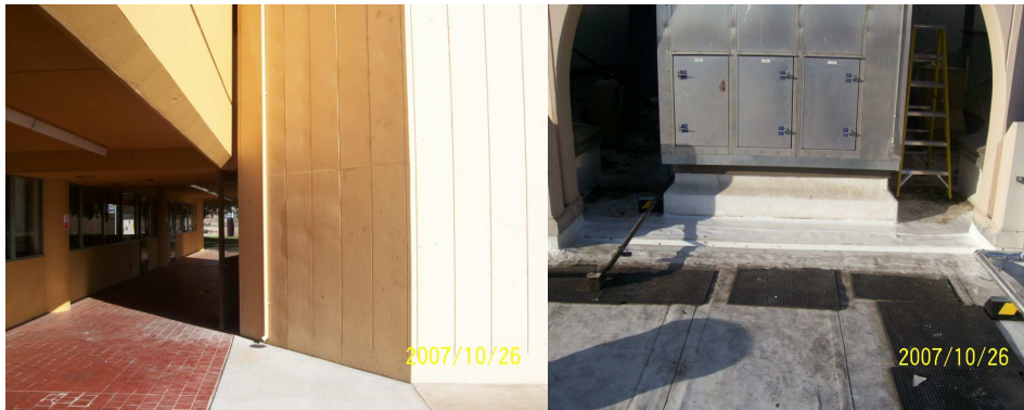
Scheduled Maintenance: Roof Drains at North & South Hall at MJC West Campus