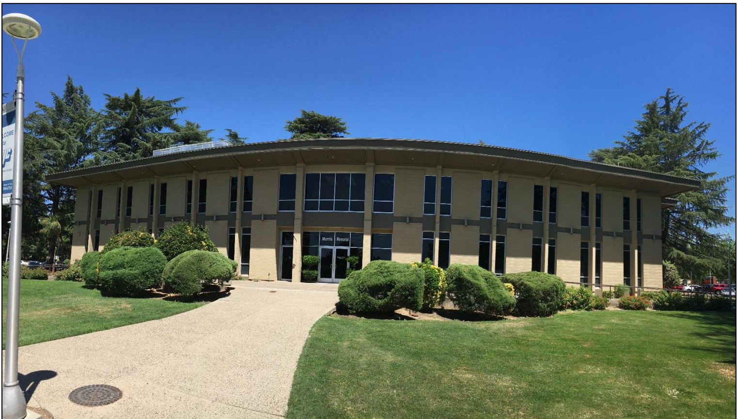
Modesto Junior College East Campus Morris Building