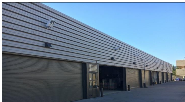
Modesto Junior College West Campus Tenaya Building