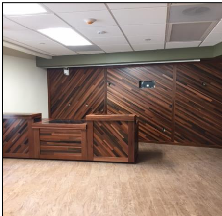
Columbia College Lower Manzanita Building Renovation