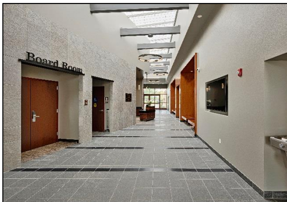
District Office Building Lobby Area