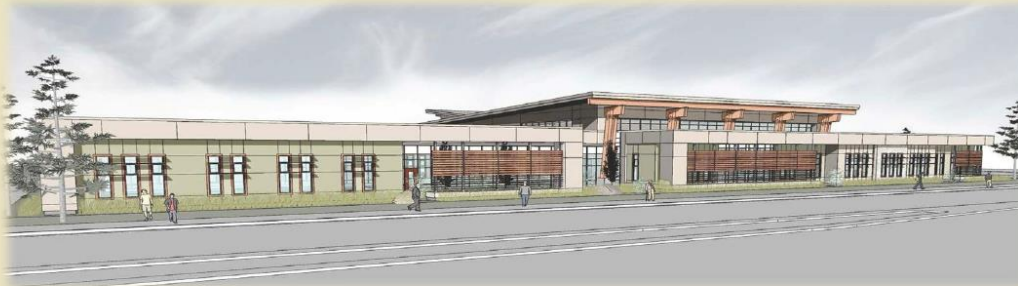
View from Blue Gum Ave

Scheduled Maintenance CC Re-Roof Madrone/ Buckeye CC Sewer Pump Replacement CC Gas Line Repair MJC Roof Drains MJC Student Center HVAC