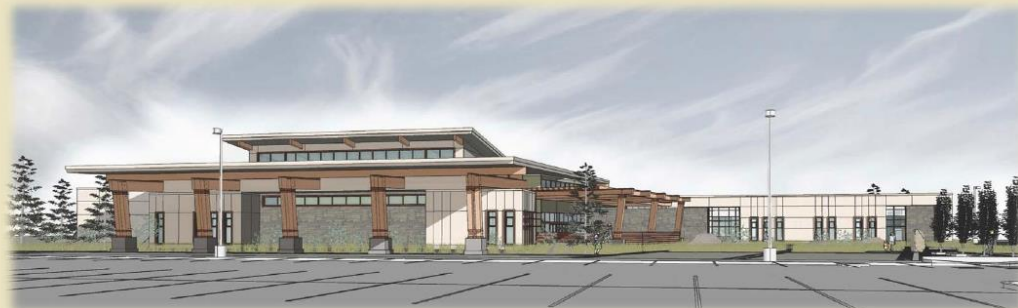
View from Campus