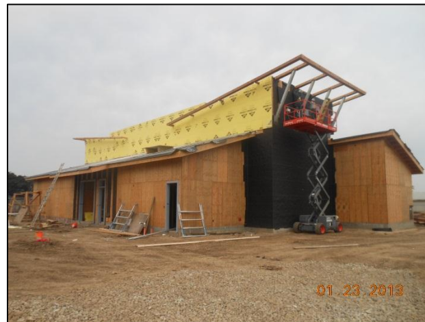
Primary Data Center, Central Services