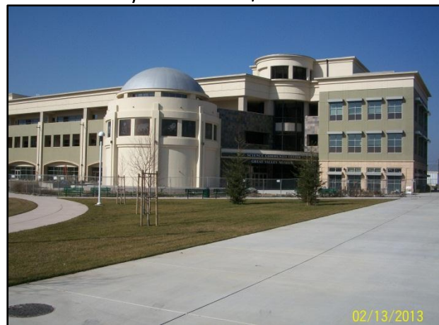
Science Community Center, MJC West Campus