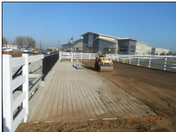
Agriculture Fencing & Feed Lot Projects, MJC West Campus