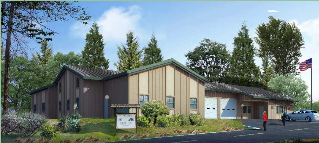
Rendering of the new Public Safety Center

If you have any questions or concerns about ongoing construction activities or would like to get additional information about ongoing design projects, please contact Kitchell, CEM at 575-6991.