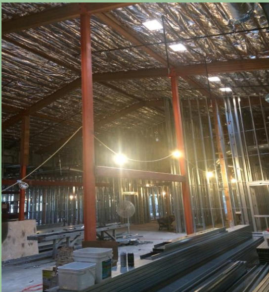
Center of Rotunda