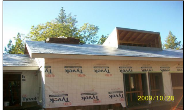
Building "B" roofing installation in progress