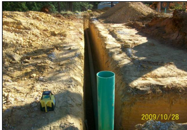
Site utilities installation continues