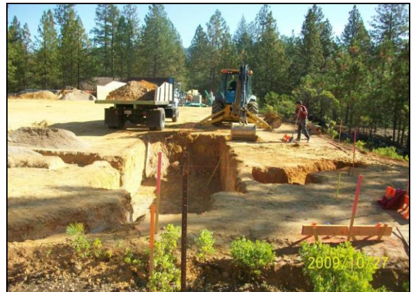
Building foundation excavation in progress