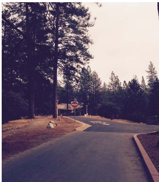
Additional striping & signage @ Redbud

If there are any questions or concerns contact Kitchell CEM, Measure E Bond Construction Manager, located at 11600 Columbia College Drive Dr., Sonora CA 95370 Tel: 209-575-7927 Email rmartin@kitchell.com