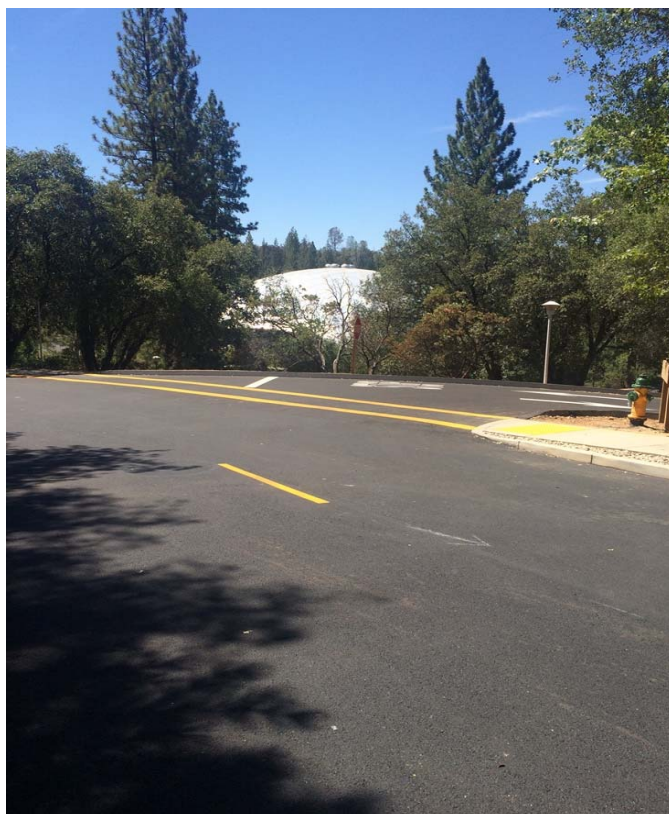
Entrance to staff parking lot

If there are any questions or concerns contact Kitchell CEM, Measure E Bond Construction Manager, located at 11600 Columbia College Drive Dr., Sonora CA 95370 Tel: 209-575-7927 Email rmartin@kitchell.com