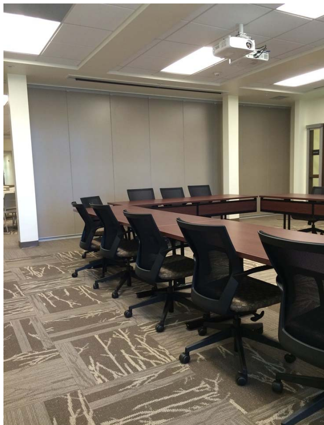
Manzanita Conference Room