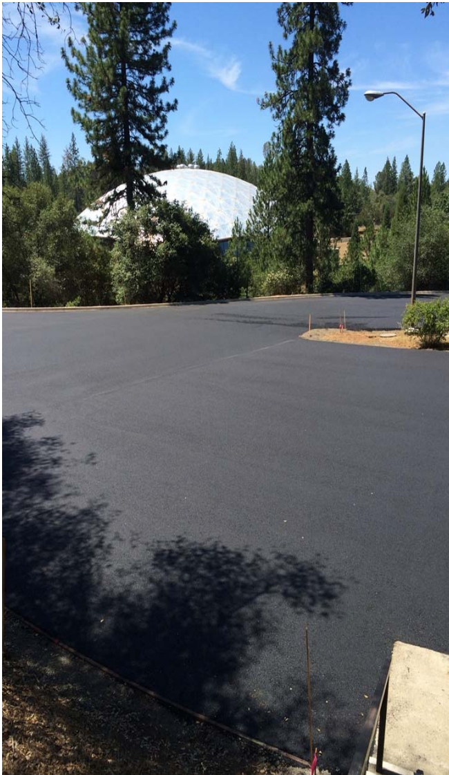
Asphalt (Staff parking lot)

Access: Caution is advised when entering the site due to tripping hazards & construction related activities. Noise: Moderate to extreme noise could occur occasionally due to site related activities. Parking: Moderate impact as staff parking has been relocated to the Oak Pavilion Lot. Dust: Moderate impact due to site related construction activities. Odors: Low Impact. Utilities: None anticipated.