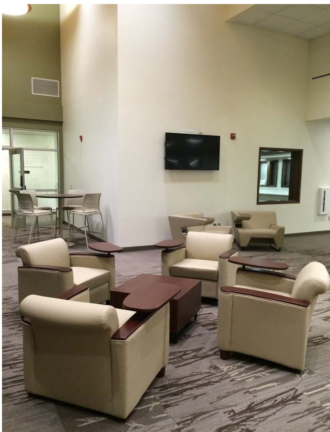
Flat screen TV in Rotunda