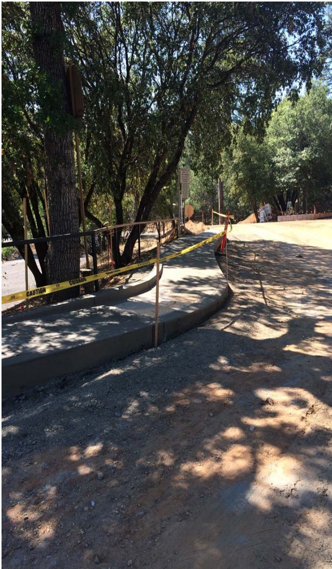
Sidewalk (Front of staff parking lot)

Access: Caution is advised when entering the site due to tripping hazards & construction related activities. Noise: Moderate to extreme noise could occur occasionally due to site related activities. Parking: Moderate impact as staff parking has been relocated to the Oak Pavilion Lot. Dust: Moderate impact due to site related construction activities. Odors: Low Impact. Utilities: None anticipated.