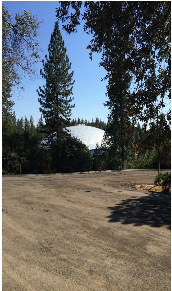
Staff lot (Finished AB)