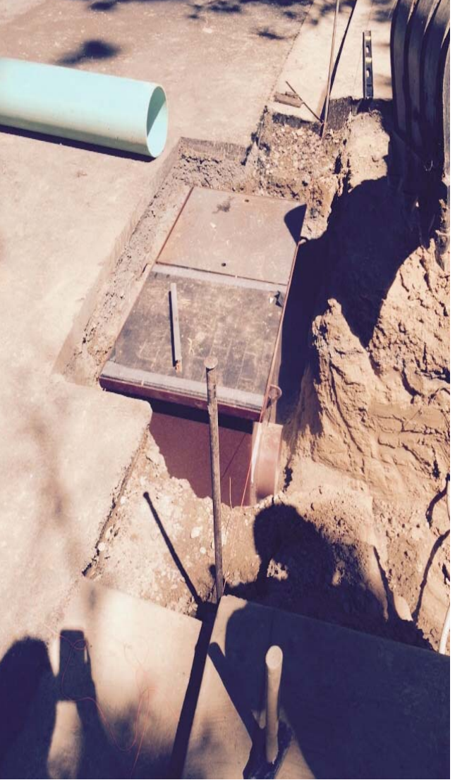
Sidewalk @ the fire house