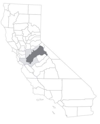
YOSEMITE COMMUNITY COLLEGE DISTRICT